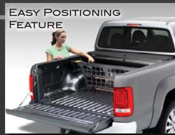
EASY POSITIONING FEATURE

CARGO MANAGER's spring-loaded control levers, located on the driver's side of the truck, enable the divider to be conveniently positioned every 3" along the bed length, without the necessity of walking to both sides of the truck.